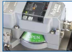
Enclosure option "A" for North America (NEC/CEC)