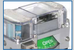
Enclosure option "V" for International (IEC)